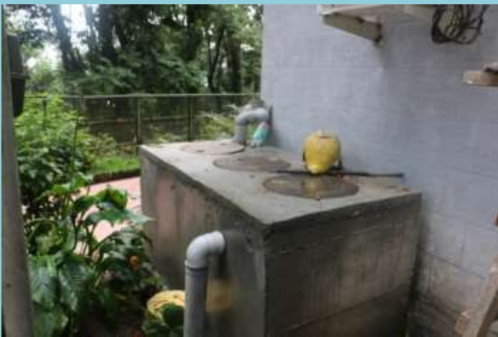
Construction of the rain water harvesting tank and filter tank