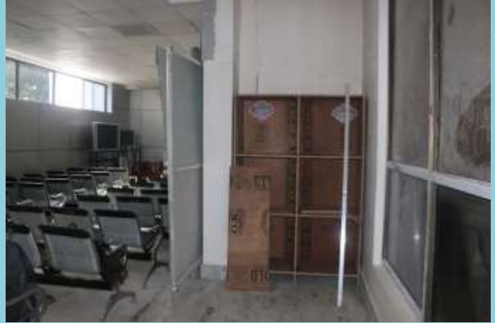
Construction of the entrance porch cum service room at the Bengal Natural History Museum