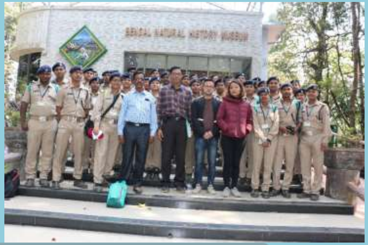
Educational Tour of RFO Trainees, Odisha Forest Rangers College