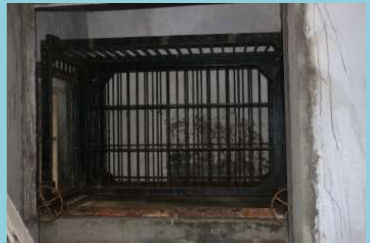
Construction of squeeze cages