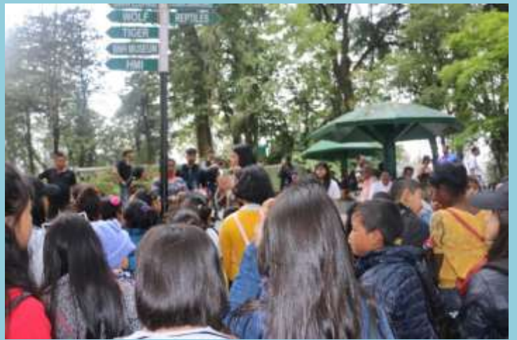
Educational Tour of Central School for Tibetans, Darjeeling