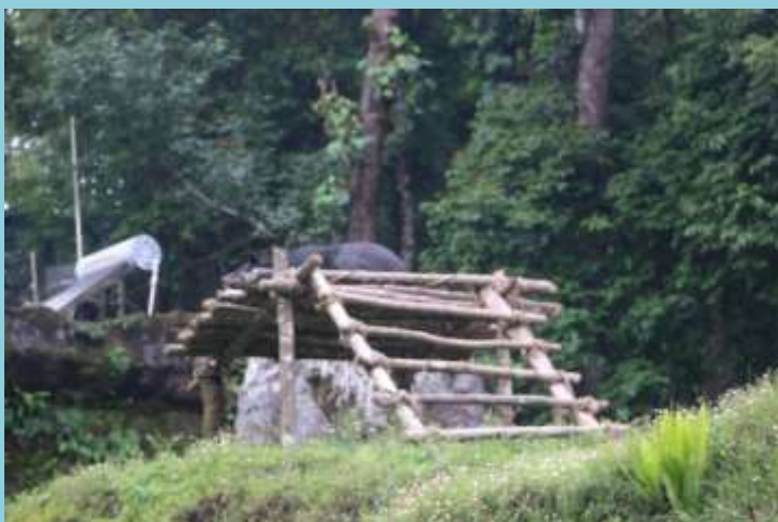
Wooden platforms at the Asiatic Black Bear Enclosure

The enrichment work taken up in this quarter include new wooden resting platform in the Asiatic Black Bear enclosure, wooden logs in the Markhor enclosure, aerial walkway in the Red panda enclosures, swinging ropes in the Common Grey Langur enclosure and new feeding platforms in the herbivore enclosures.