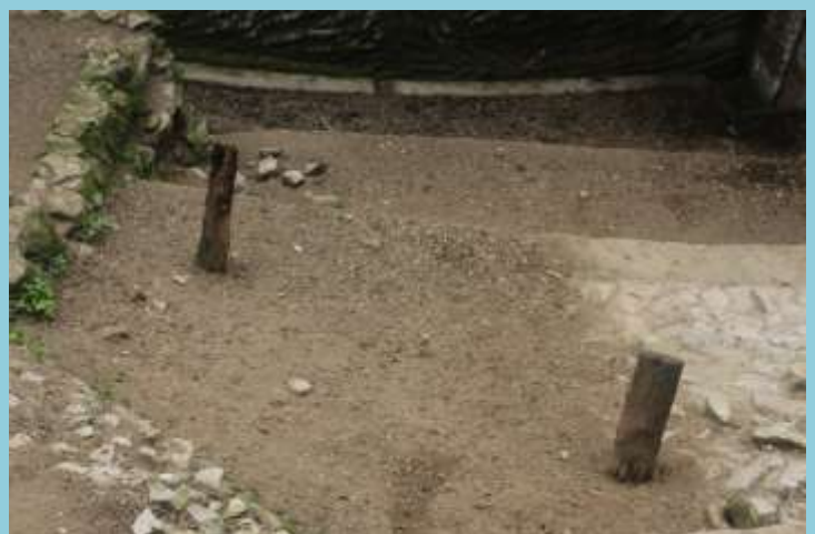
Logs in the Markhor enclosure