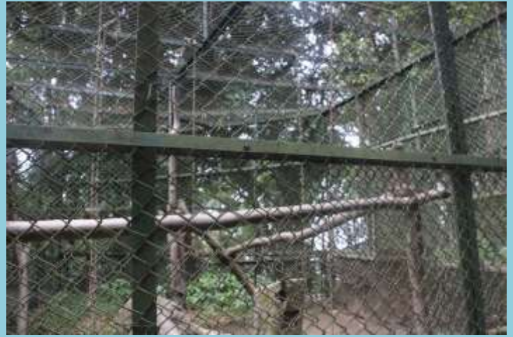
Ropes for swinging at the Langur enclosure