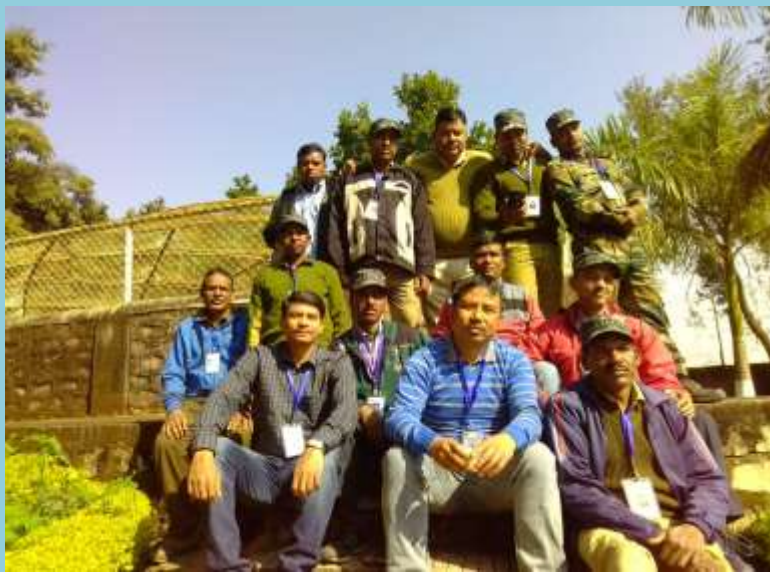
Training for Technique of capturing of deer and other animals at Zoological Garden, Alipore Kolkata