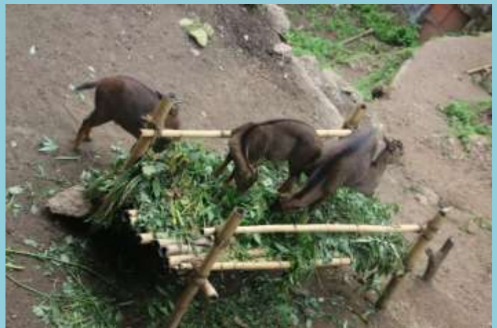
Feeding platforms in herbivore enclosures