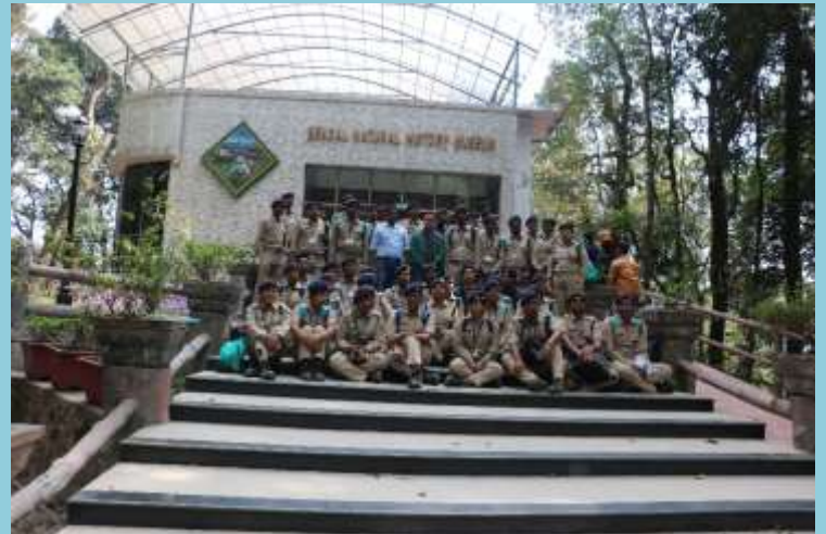
Educational Tour of RFO Trainees, Odisha Forest Rangers College