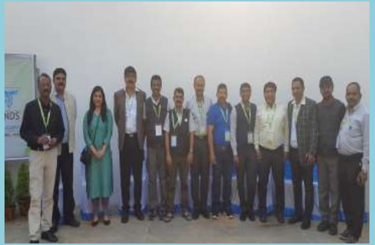
Training for Indian Zoo Veterinarians at Shri Chamarajendra Zoological Garden, Mysore.