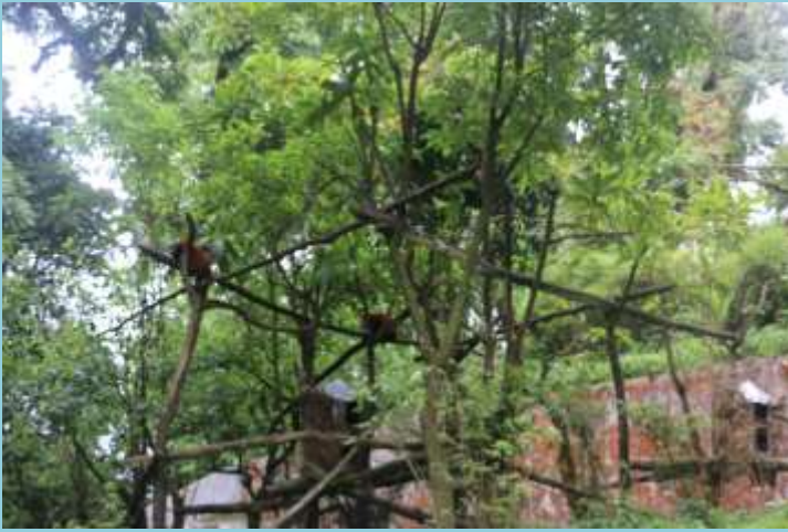
Aerial Walkways in the Red panda enclosures