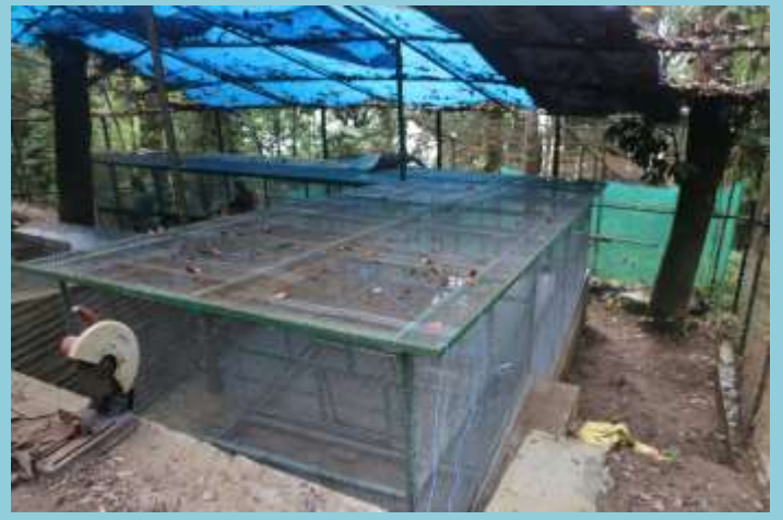
Construction of treatment cell coupe for lesser carnivores