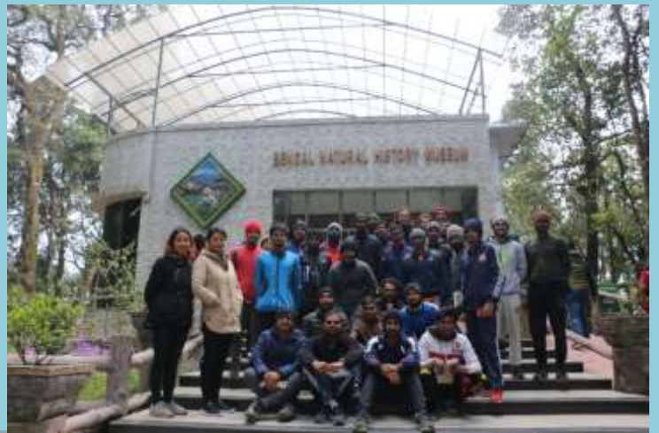
Educational tour of the trainees, Basic Course, HMI