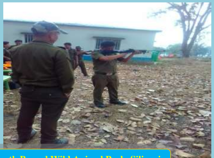
Training for Chemical restraint of Wild Animals at North Bengal Wild Animal Park, Siliguri