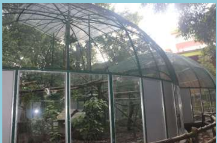
Modification of the Aviary