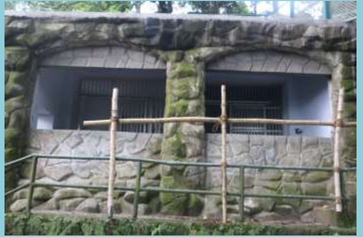
Modification of the old tiger exhibit